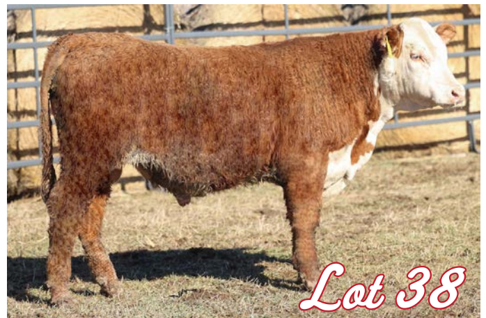
9253 sired bull. He is Top 3% Milk, Top 10% Milk and Growth, and Top 15% Ribeye. This bull is polled.