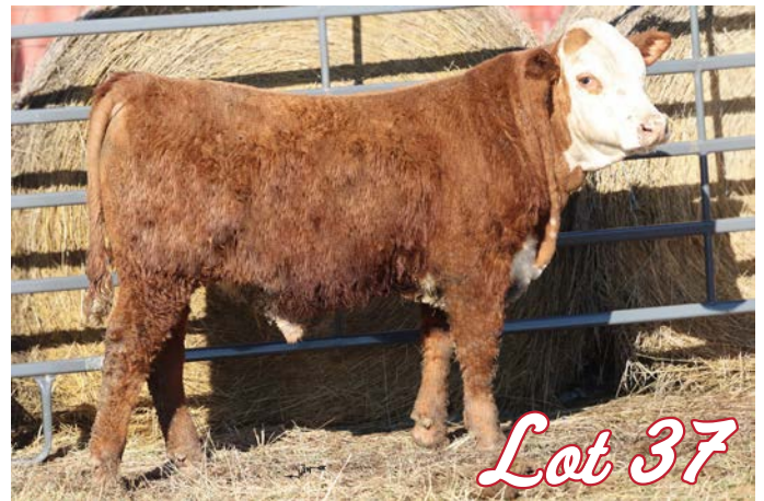
Rimrock sired Hereford bull. He is Top 10% Milk, Top 15% Milk and Growth, Top 25% Ribeye, and Top 30% YW. This bull is polled.