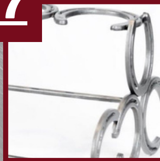
HORSESHOE BOOTRACK THE HERITAGE FORGE