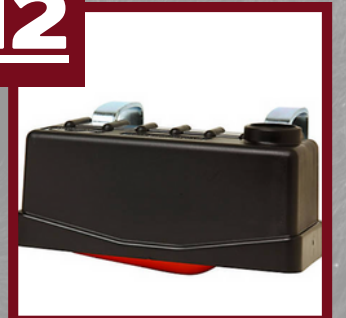
FLOAT VALVE TRACTOR SUPPLY