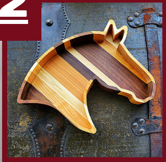
CATCH ALL TRAY DDR FAB