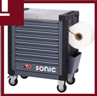
TOOLBOX SONICTOOL USA