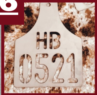
EARTAG HOUSE NUMBER