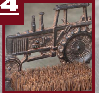
BOOT SCRAPER VINTAGE SHOPPER