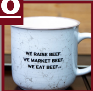
COFFEE MUG KROSE COMPANY