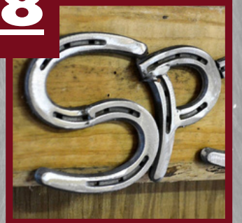
CUSTOM STALL SIGNS WHISKEY RIVER TRADING