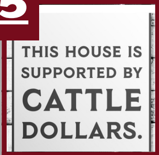
ALUMINUM SIGN KROSE COMPANY