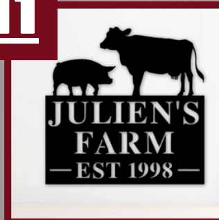
FARM SIGN NICHOLS BOUTIQUE CO.