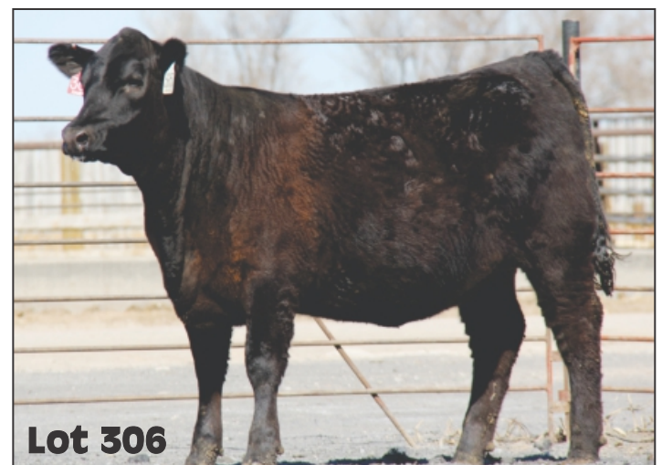
These JB daughters are getting a lot of attention.