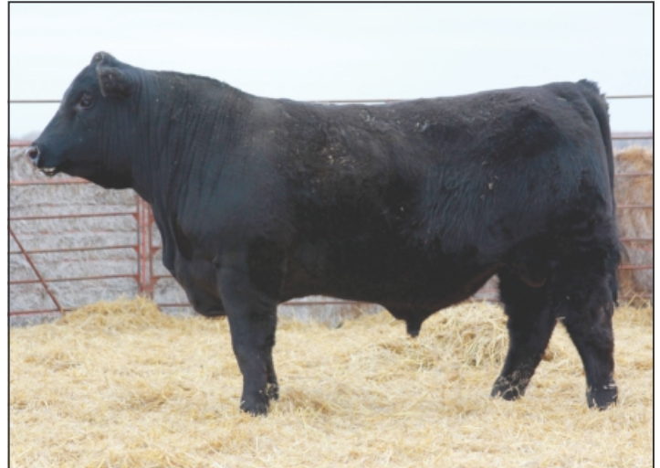
HL SUNDANCE 2FX3