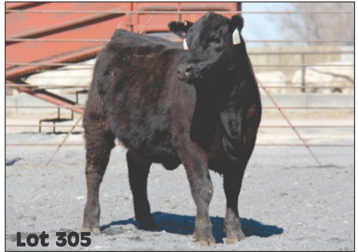
Length and style.