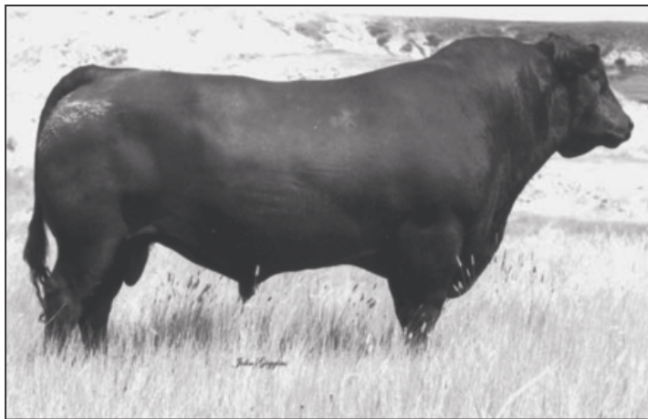
RC BLACK CIGAR 0293