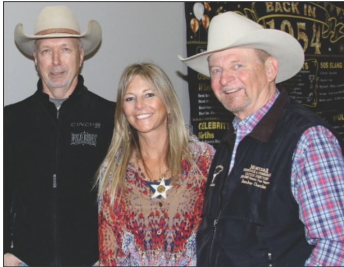
70th Birthday Party.