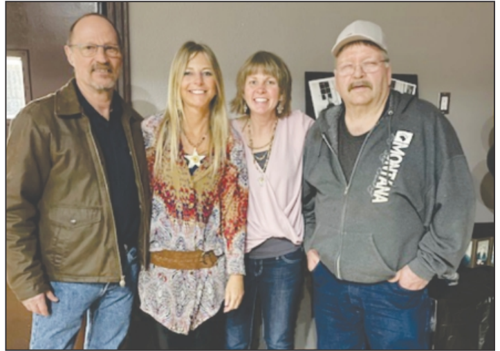
70th Birthday Party.