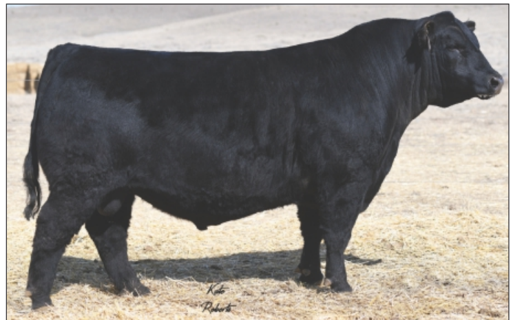
FOX CREEK 8432