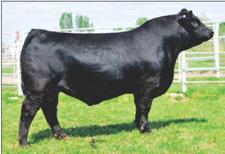
MERIT RAGE 4031B