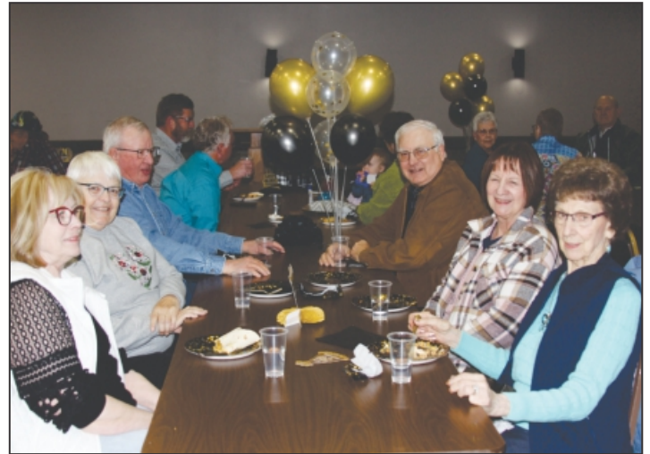
70th Birthday Party.