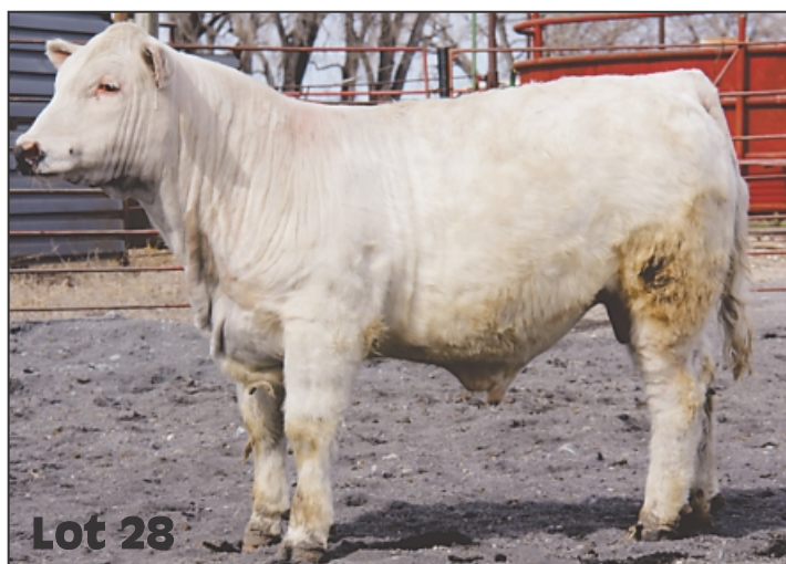
Moderate frame with a lot of eye appeal.