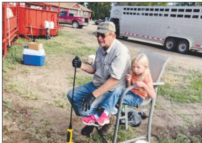
Taking a break.