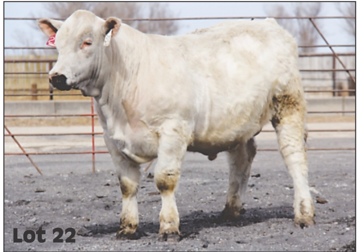
A nice pattern, quiet disposition. A lot of things to like about this bull.