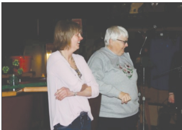
70th Birthday Party