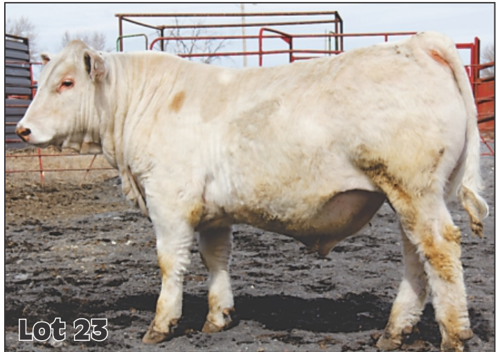
Super disposition, meat machine with a lot of style.