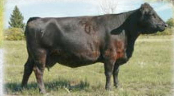
GREAT DAM TO 98Z