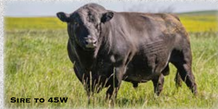
SIRE TO 45W

PINEBANK WAIGROUP 152/04 PINEBANK SE 10D PINEBANK WAIGROUP 92/99