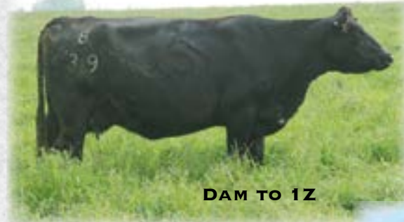
DAM TO 1Z