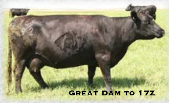
GREAT DAM TO 17Z