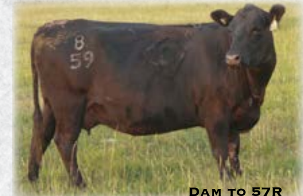
DAM TO 57R

EMULATION N BAR 5522 N BAR PRIMROSE 2424 PBC 707 1M F0203 DIXIE ERICA OF CH 615 O C C EMBLAZON 854E D D A MELISA 824 HIGH VALLEY 4C6 AMBUSH D D A GALATEA 423