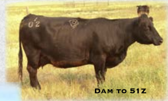
DAM TO 51Z