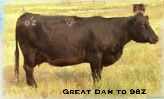
GREAT DAM TO 98Z