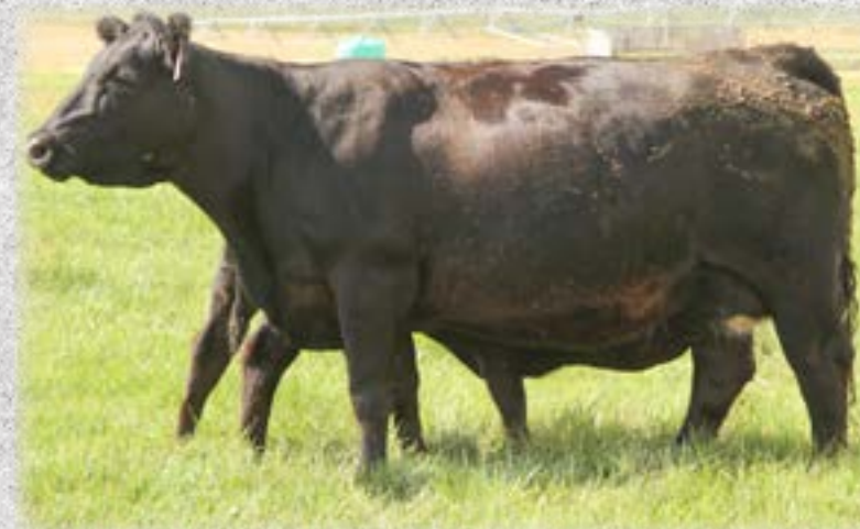
GREAT DAM TO 76Z DDA MELISA 174