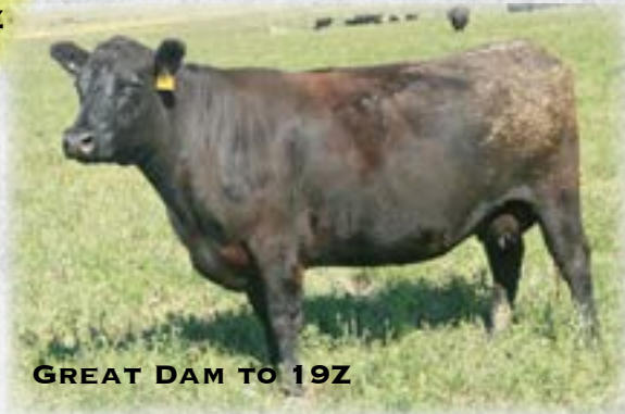
GREAT DAM TO 19Z