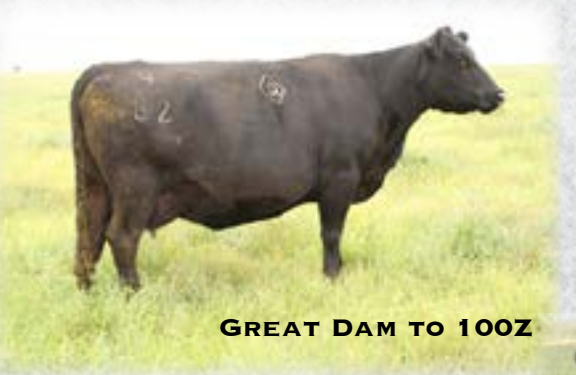
GREAT DAM TO 100Z