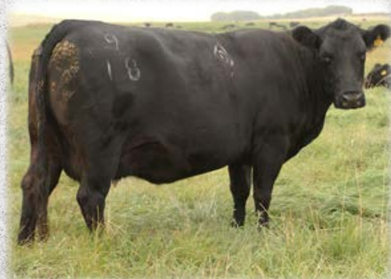
GREAT DAM TO 51Z DDA HOLLY 918