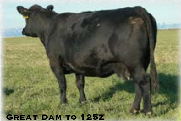
GREAT DAM TO 125Z