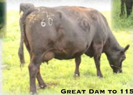
GREAT DAM TO 115Z