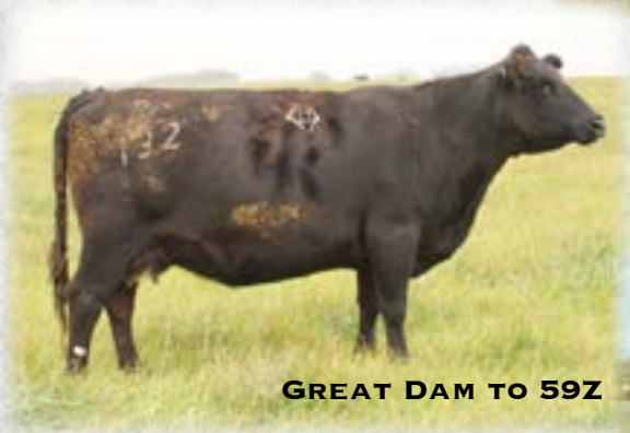
GREAT DAM TO 59Z