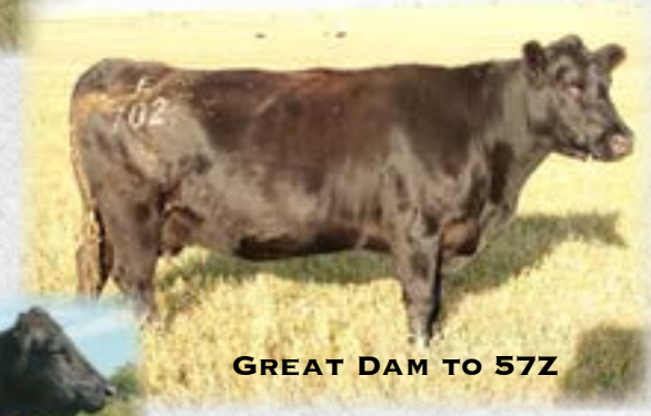
GREAT DAM TO 57Z