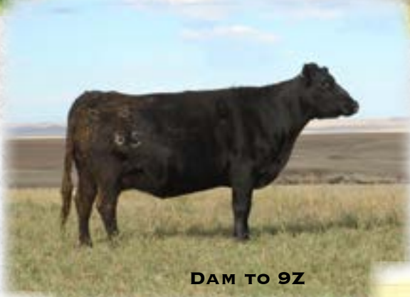
DAM TO 9Z