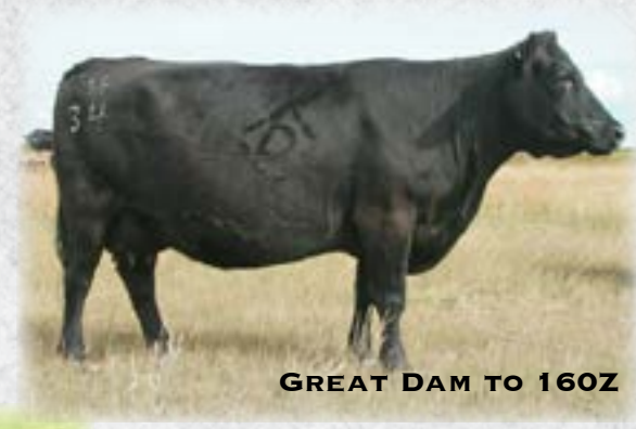
GREAT DAM TO 160Z