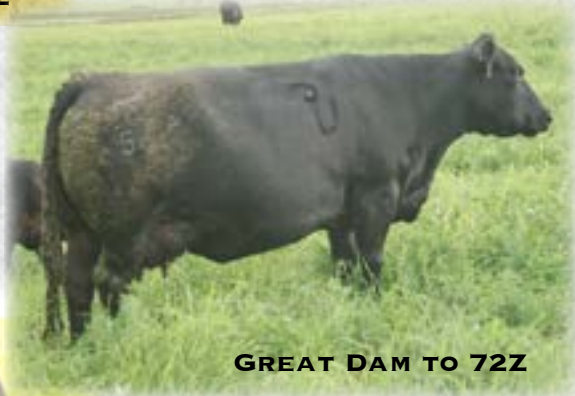
GREAT DAM TO 72Z