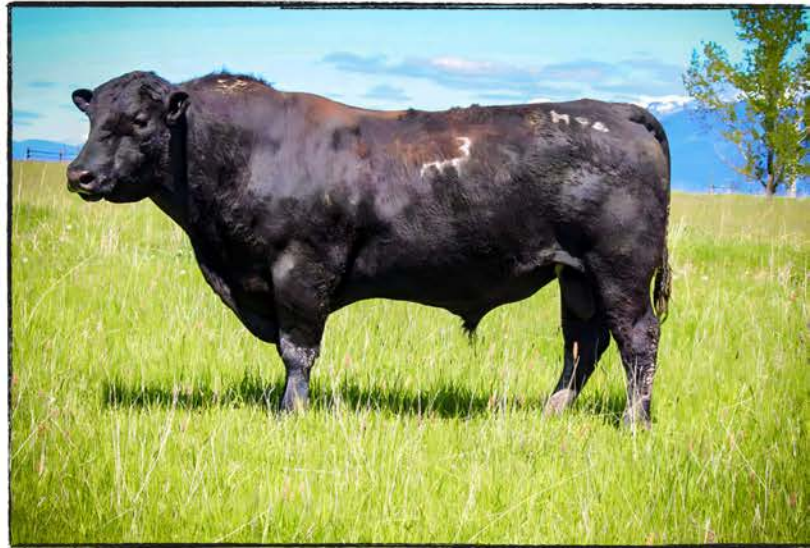
HCA Legendary H94

Sired our top selling lot in last years bull sale!