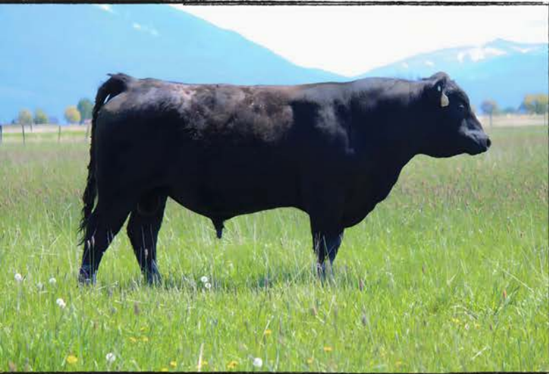
BLEVINS Full Measure H310

Sired our top selling lot in last years bull sale!