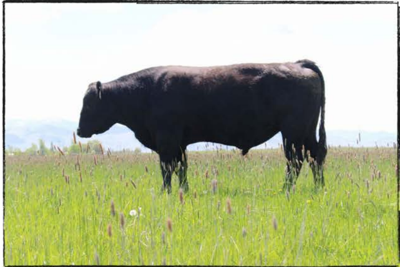
BLEVINS Know How J338