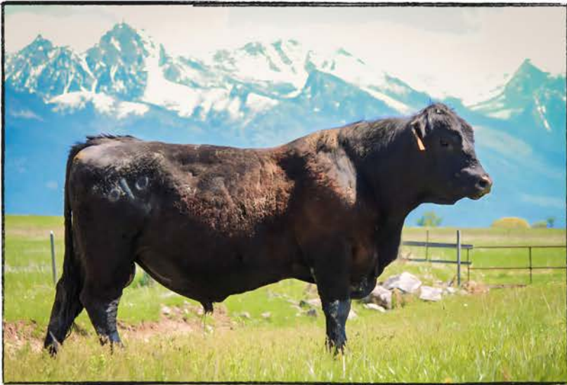
Big Rok Statement 06